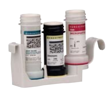
ARCHITECT i1000sR Reagent Carrier