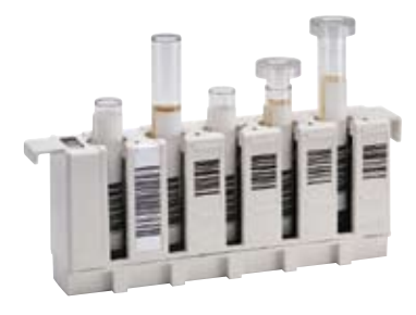
Universal ARCHITECT Sample Carrier